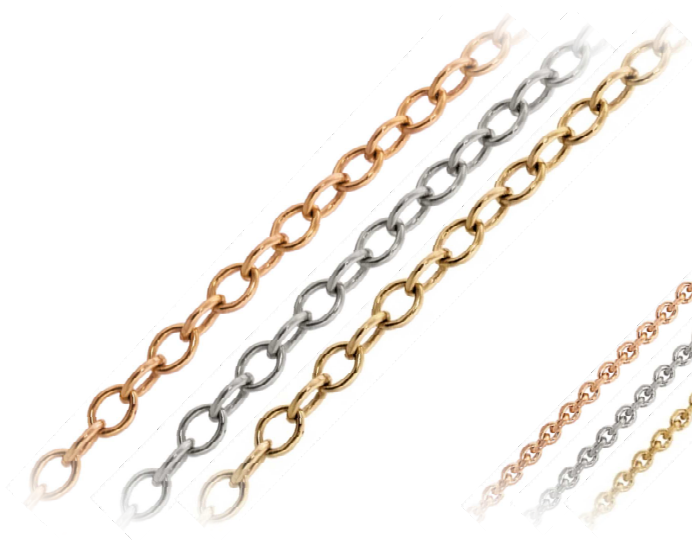
PAVE OF CURB LARGE